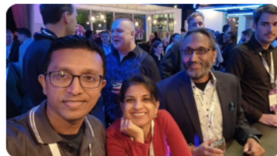
StrikeTru team taking a break for the photo op! Versa-Valves, Director of Digital Technology.